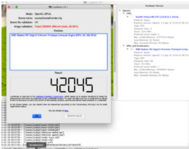
Luxmark with 2x cards one UEFI other Legacy. Color is normal and no errors.